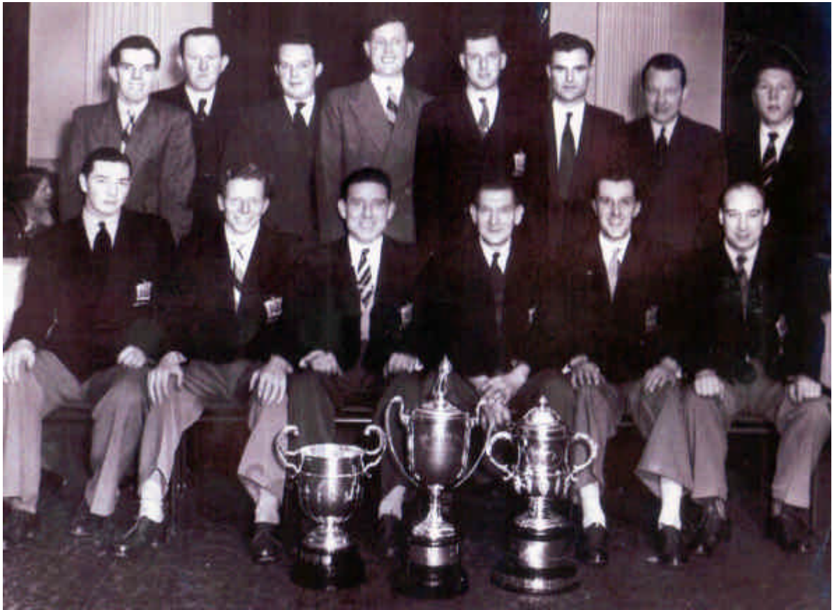
The Boys of '54