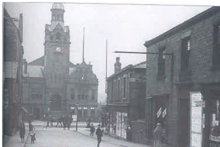
The Town Hall in 1905