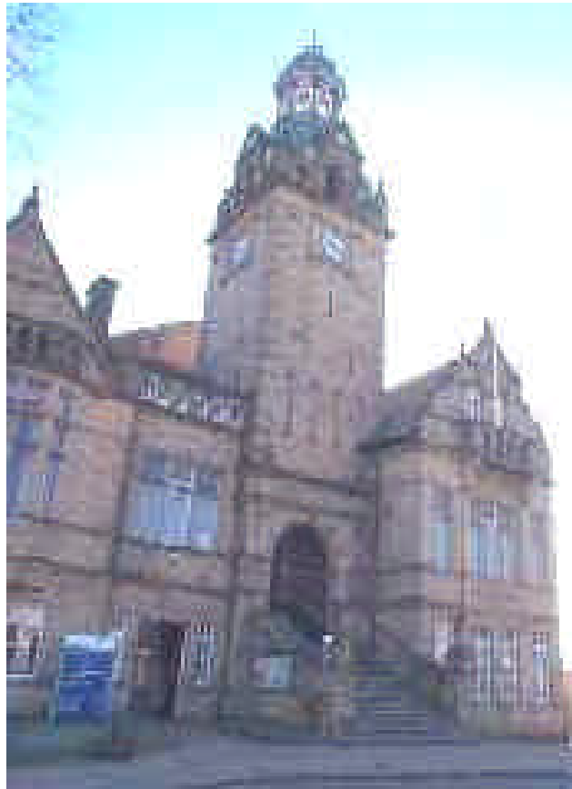
The Town Hall today