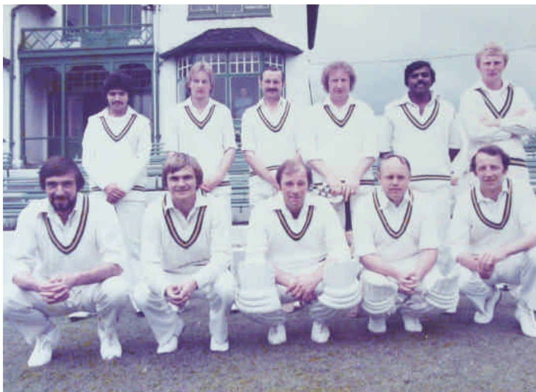
1981 1 ST XI