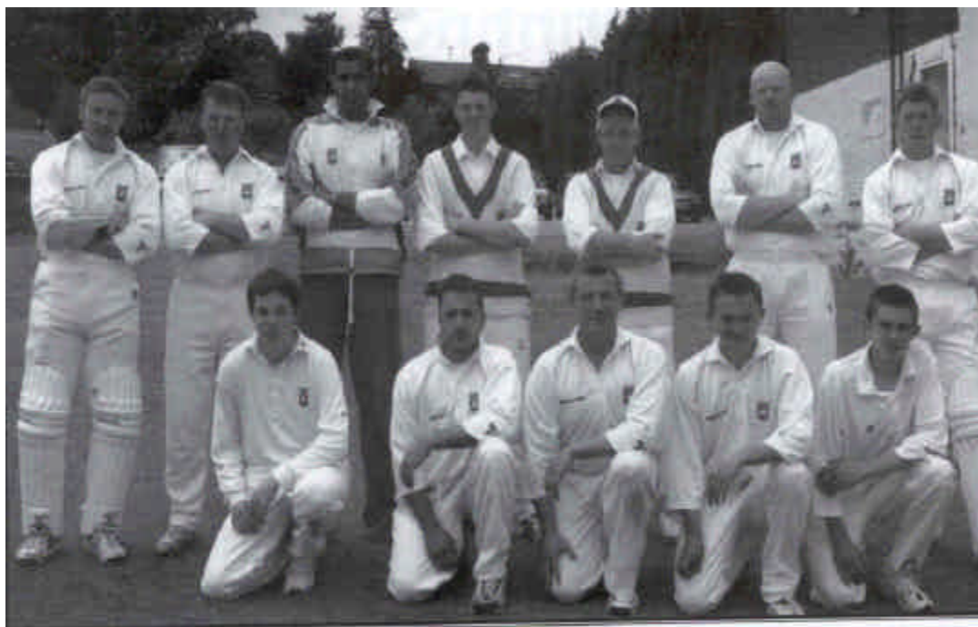
BRADFORD LEAGUE. DIVISION ONE. SEASON 2002.