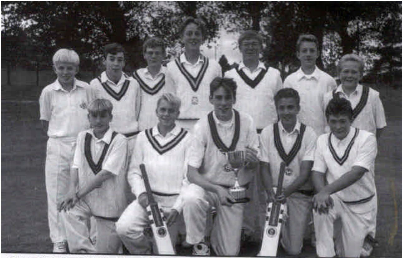
CLECKHEATON Under 15's. 2nd DIVISION CHAMPIONS. 1992

Cleckheaton Cricket Club are very proud of its juniors, too.