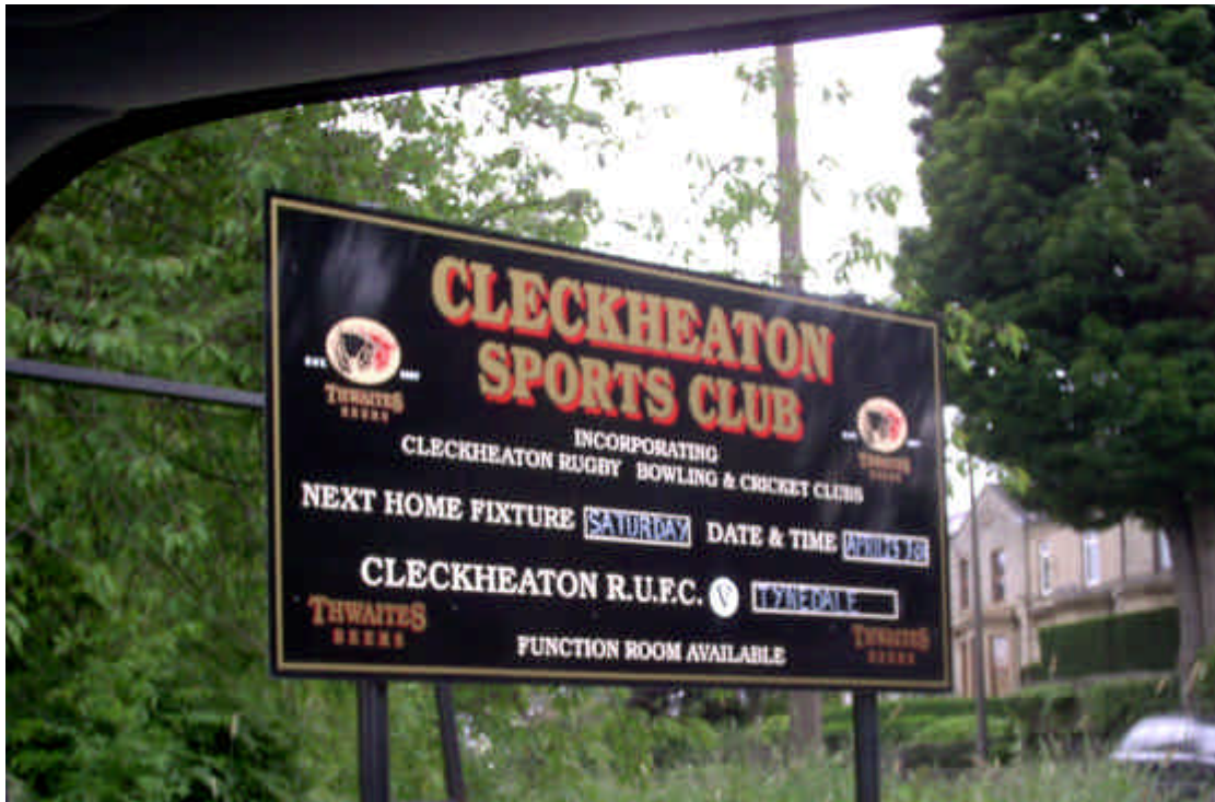
The sign outside the Club today