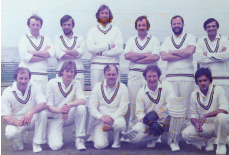
1980 1 ST XI