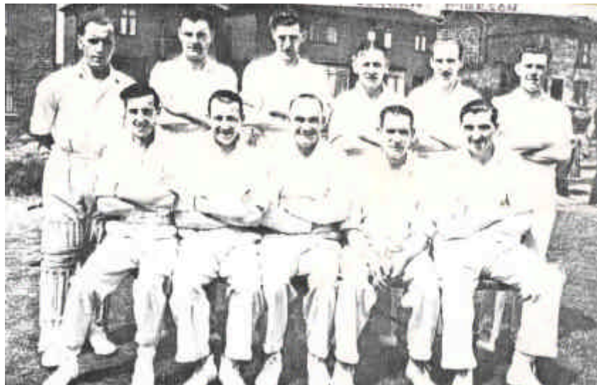
Post-war Birstall cricketers

However, in 1948 Cleckheaton managed to achieve an astonishing victory against Birstall in the second round of the Heavy Woollen Cup, posting a total of 411 in the process. This was their highest score in the competition.