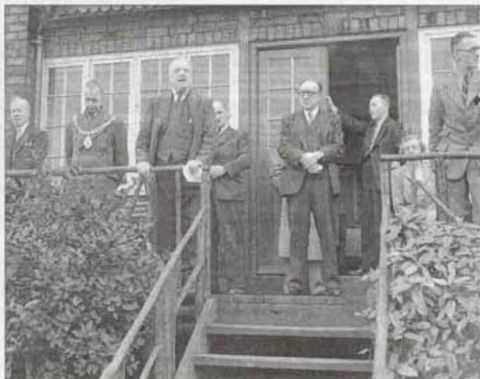
Civic dignitaries at the ground.