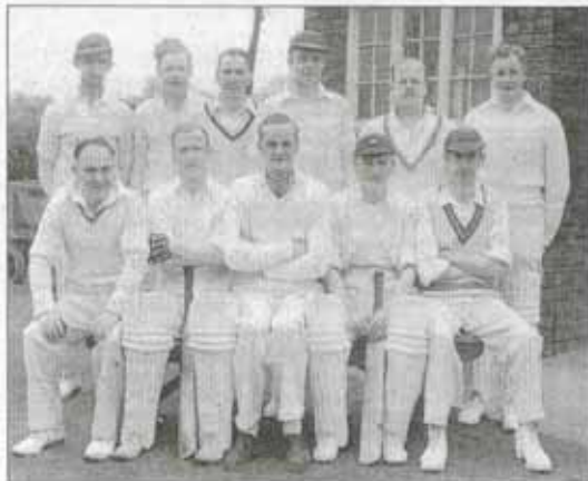
The new Mirfield team in 1952. (NS)