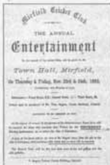
An 'annual entertainment' bill from 1882.

Between 2001 and 2004 the club locked horns in the Bradford League, but due to a financial cri-