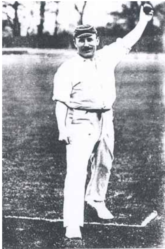
Hirst in later life