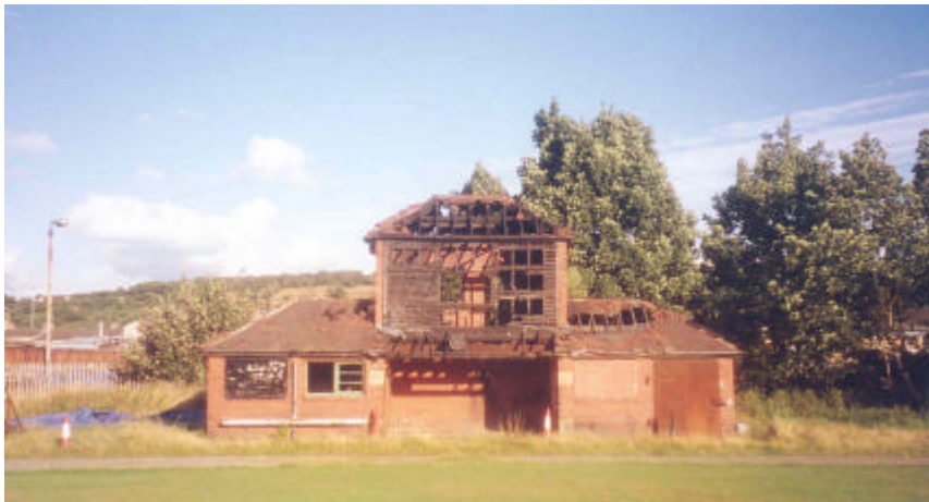
The remnants of the Bradley Mills scoreboard

However, in 2003 they had to scrap their 2nd XI because of a shortage of players, a move that had serious consequences, not just on the playing side - their strength in depth had gone - but also in terms of where they played their cricket.