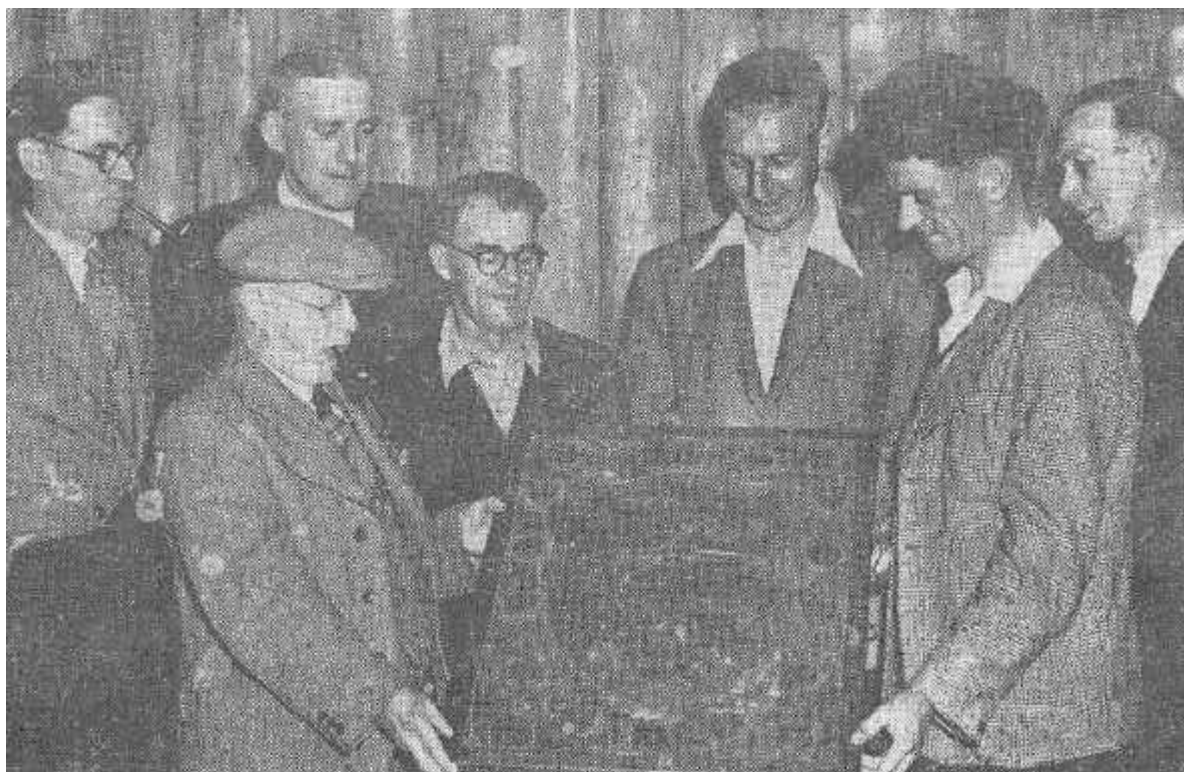
Mirfield & District News, 15 May 1954

In 1912 Mirfield Parish CC won the Dewsbury & District Junior League Shield outright.