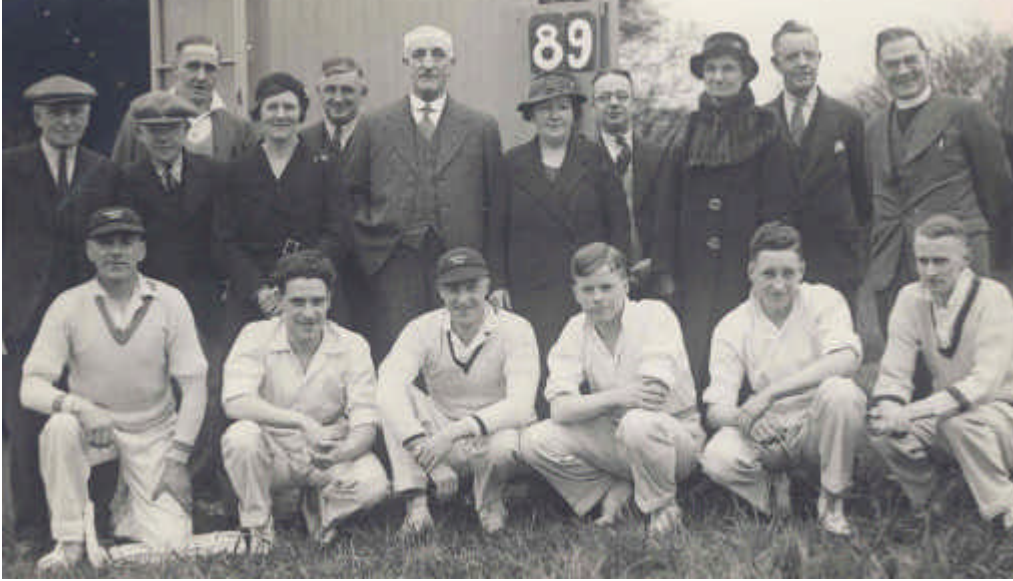
April 1937 – Function to mark the opening of the new pavilion