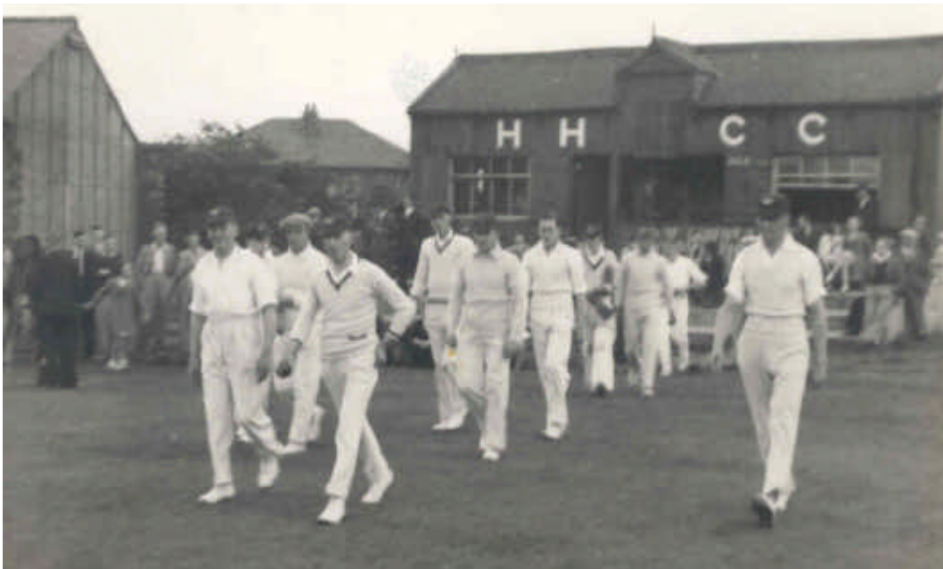
1938 Shield Final - played at Bennett Lane, home of Hanging Heaton CC (Parish lost to Dewsbury Railways)