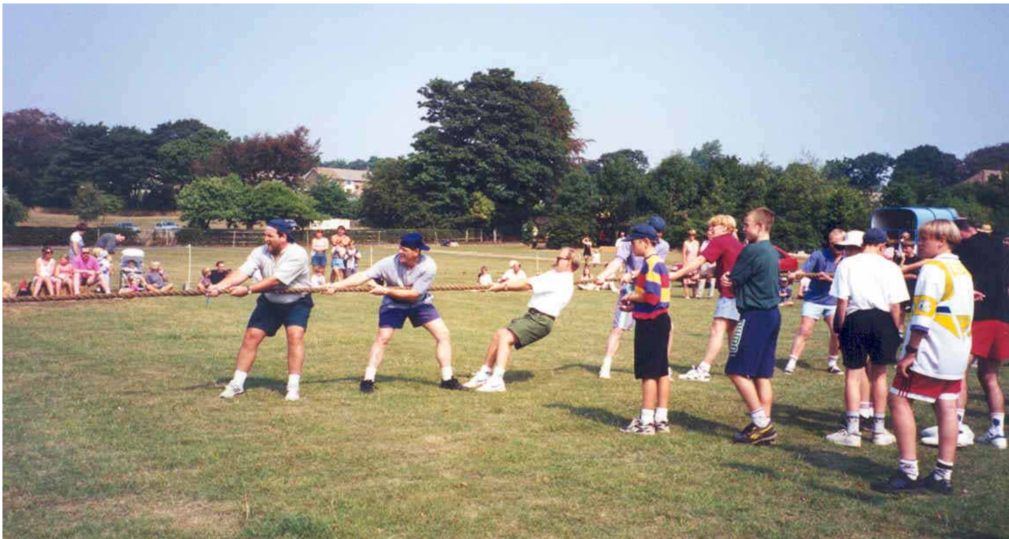
1997 approx. Club Members at Mirfield Agricultural Show