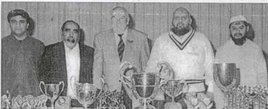
Mount CC celebrated their 21st birthday in 1995 with a special function. (N5)

the relationship with Howden Clough was short-lived. However, in 2002 another partnership received the green light, with Mount setting up shop with Staincliffe CC from the Central Yorkshire League.