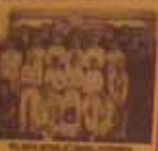
Members of the club posing for a group photo.

Windmills were a common sight in the area, used for various purposes including grinding grain.