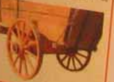
A horse-drawn cart used by the club.

The club faced various challenges in 1820, including financial difficulties.