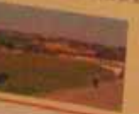
A member of the club dancing.