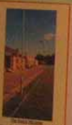
A view of the street in Thornhill.

The church was used for various community events.