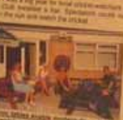
Members of the club enjoying a drink.