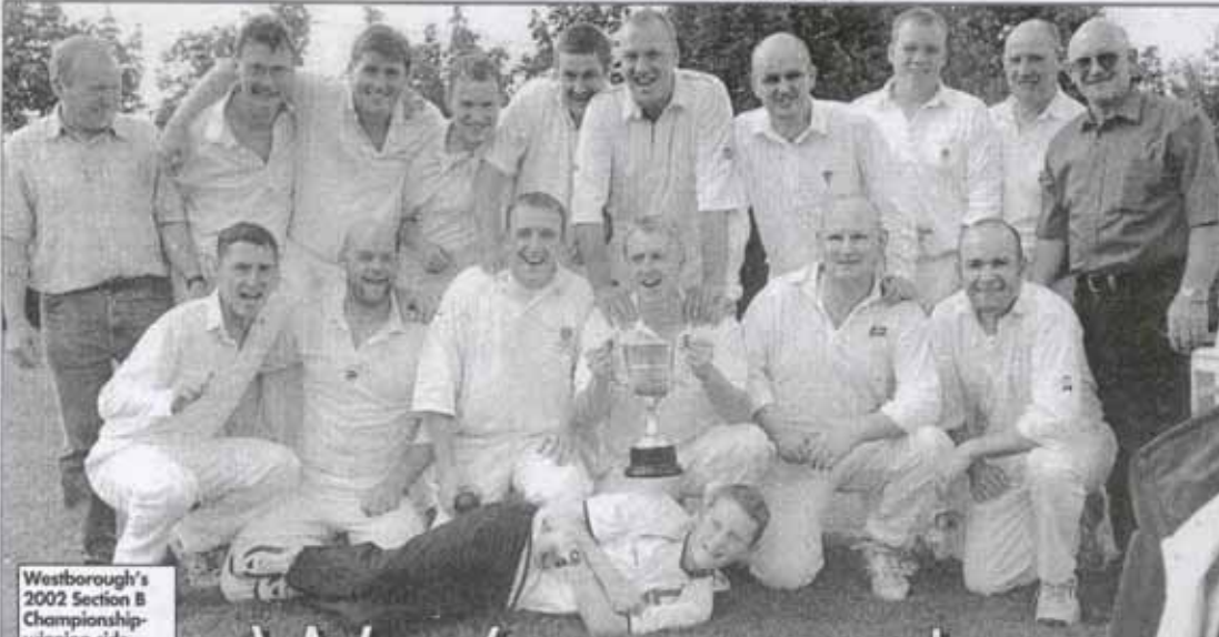
Westborough's 2002 Section B Championship-winning side.