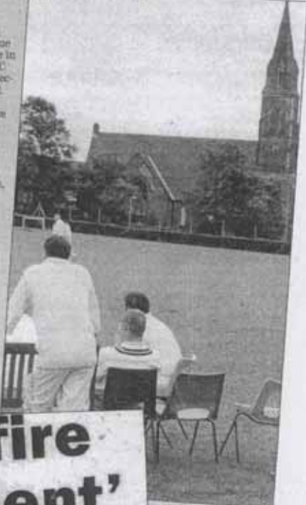
Above: The view from the boundary.