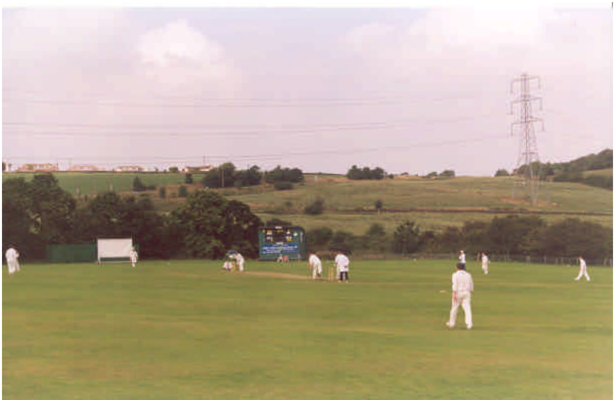
The ground today

In 1961 the Association authorities described Birchenclyffe as a club that was, ‘by its own exertions...forging ahead, and which is so obviously a credit to the Association.’