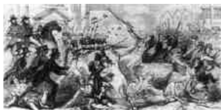
A plug plot riot, August 1842

The disappointment of the Reform Act together with a number of other developments, including economic depression, led to people organising themselves to air their grievances. Many became Chartists. The Chartists expressed their demands in a six point Charter which called for universal (male) suffrage, annual parliaments, vote by secret ballot, abolition of property qualifications for MPs, payment for MPs and equal electoral districts.