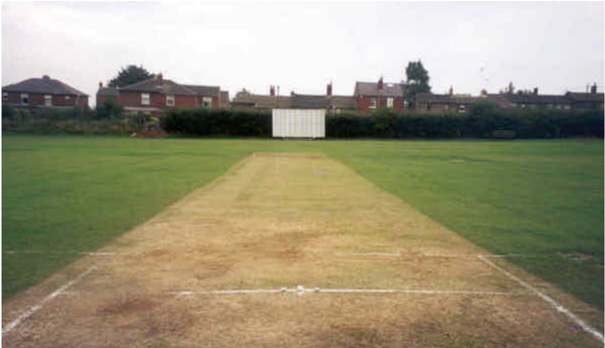
The venue, Emley, today