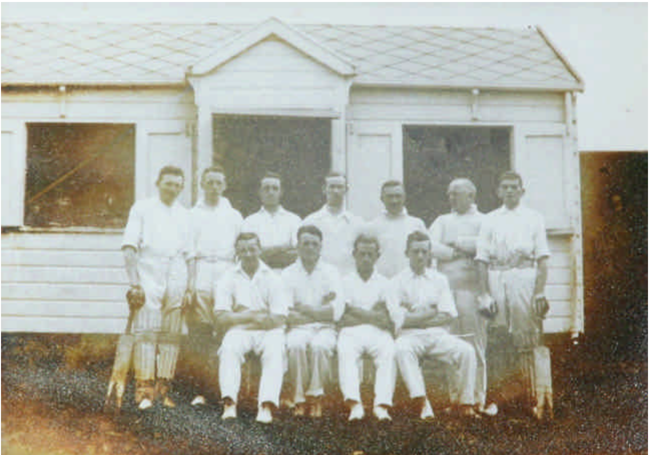
Nortonthorpe C.C. circa 1920s. Can you name the exact year?