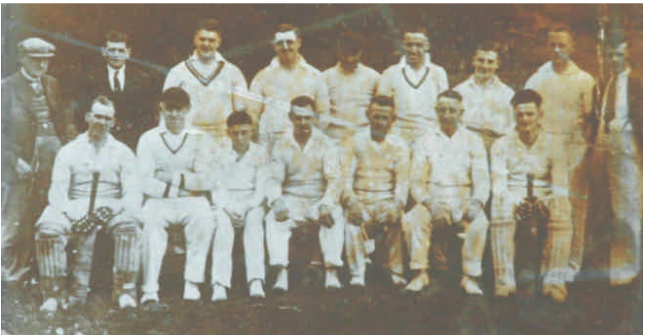
A Nortonthorpe team from the 1930s or 1940s. Do you recognise any faces?